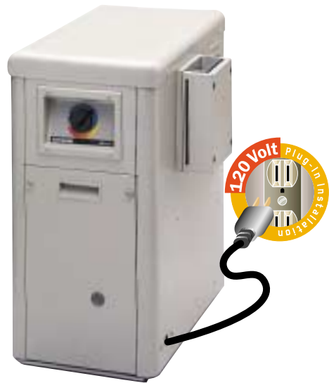
Hayward H-Series Induced Draft Heater